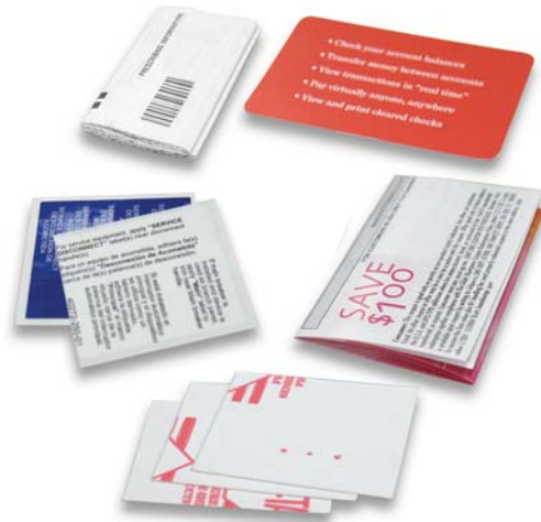
A sampling of the products that can be fed.