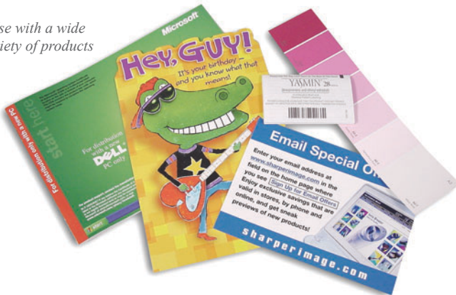
Use with a wide variety of products